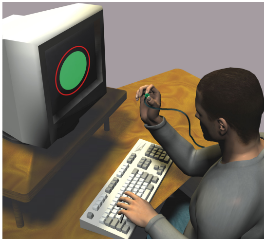
Fig. 3. Experimental setup. The subject sits in front of a monitor, holding a 3D absolute position sensor (Polhemus Liberty). Here n_h = 2 , n_s = 1 . The center-stationary green circle is the target, whose diameter ( s(t) ) fluctuates according to damped Brownian motion, and there is a concentric 'cursor' (red circle) whose diameter is z(t) = m(t)^T h(t) , with m(t) fluctuating according to an independent damped Brownian motion. The subject is then told to move however possible to try to keep z(t) = s(t) . Trials are 1 min., started by a key-press and sampling rate is 50Hz.

subjects, as shown in Fig. 2(a), were able to track the target. When the map's velocity changed or for some other reason they lost the map, they exhibited sudden large exploratory movements and then tracked for another period of time. Often both the model and human exhibited exploratory movements at similar times.