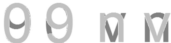
Fig. 2. Illustration of physical overlap (cross-correlation) between symbols. On the left we have overlaid an Arial font '9' (dark grey) on '0', and '0' (dark grey) on '9'; these symbols have a very high cross-correlation of 0.85. On the right an illustration of overlaying 'v' (dark grey) with 'n', and 'n' (dark grey) on 'v', respectively; these two letters have a quite low cross-correlation of 0.37.

There are many ways to compare the image properties of letters and digits – for example, one might count absolute strokes per symbol or the number of curved vs. straight strokes. To avoid making any a priori assumptions on how to carve up the symbols, we computed letter and digit image-based similarity using one of the simplest methods for template matching and similarity estimation: normalized cross-correlation (Lewis, 1995). To do so, we cross-correlated each pair of symbol images, and found the peak of the cross-correlation map, that is, the horizontal/vertical translation of one image with respect to the other that maximizes their alignment. We then recorded the respective correlation coefficient (i.e., degree of overlap between the two images, see Fig. 2a) as an estimate of similarity: the higher the correlation, the more similar the images of the two symbols. This provides an estimate of maximal similarity between two symbols, and the cross-correlation coefficient can be thought of as the worst-case scenario when discrimination of a symbol from its competitors is most difficult. This analysis was done separately for letters and digits displayed in high contrast (black against white background) and it was done for two